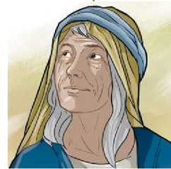
UM..... (Eksodusi 15:20)